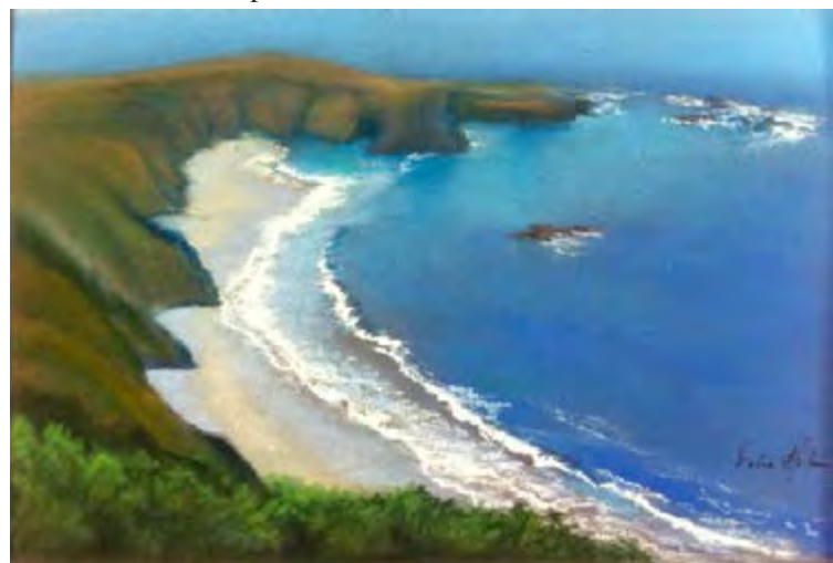
A watercolor by Dalia Alekna.

during library hours. Artists can submit an application to be considered for future exhibits at www.ci.lafayette.ca.us/city-hall/commissions-committees/public-art-committee/library-gallery .